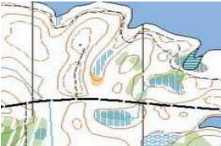
Map example from Tokkekøb Hegn